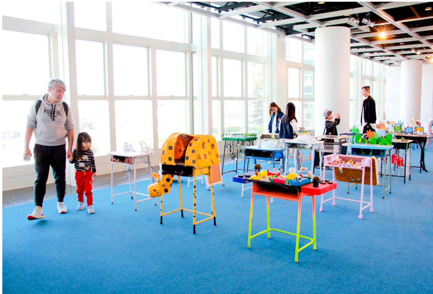
Hong Kong Visual Arts Education Festival 2020