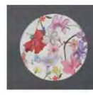
Untitled Watercolour on paper with collaged embroidery 41cm x 35cm Presbyterian Ladies' College Melbourne Maise Zheng 8 years old